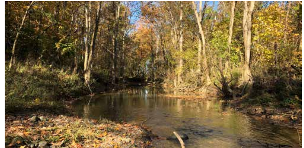
Bumb Property in Huron County