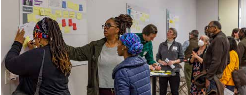
EPA Land Use Summit